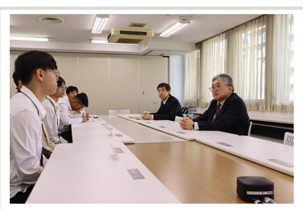
Welcome remarks by the director