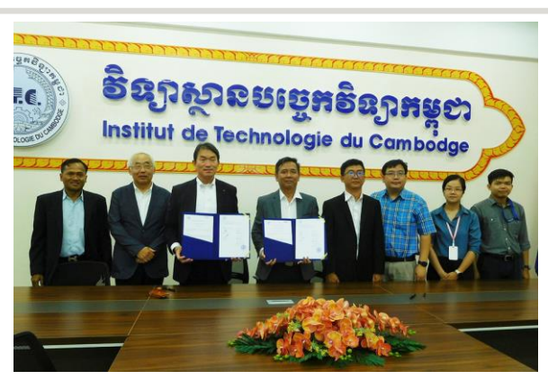
MOU Singing Ceremony with ITC